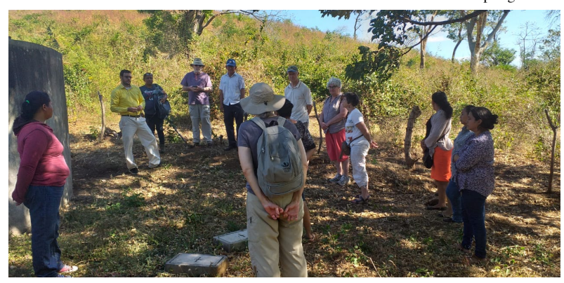
Visiting the new water tank in San Carlos