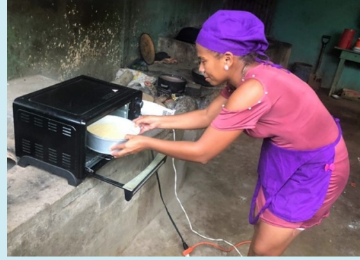
Class materials, equipment and vocational training