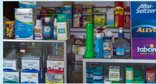
A local pharmacy start-up