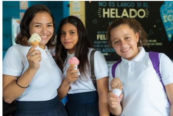
The Newest Youth Enterprise - an ice cream shop!